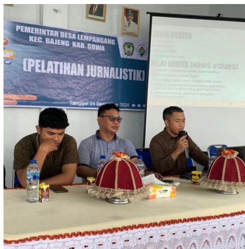
Picture 3. First material from Kominfo Public Relations

The active participation of residents in this journalism training is a very positive first step in creating community-based information media in Lempangang Village. This will not only strengthen the relationship between the government and the community, but also provide an opportunity for residents to voice their views and aspirations through writing that can be accessed by the wider community. This appreciation is expected to motivate participants to continue learning and developing their skills in journalism, as well as playing an active role in building more effective and productive communication in the village.