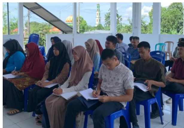
Picture 6. Enthusiasm of Training Participants

The resource person emphasised that a good caption should be short, clear, and able to describe the essence of the news or photos displayed. Participants were then asked to practice making captions based on the images provided, with direct guidance from the Syiar Alauddin TV team. This session was very interactive, where participants not only listened to the theory but also directly practised the techniques taught. Through this material, it is hoped that the residents of Lempangang Village can be more skilled in making news and presenting information that is interesting and easily understood by the wider community.