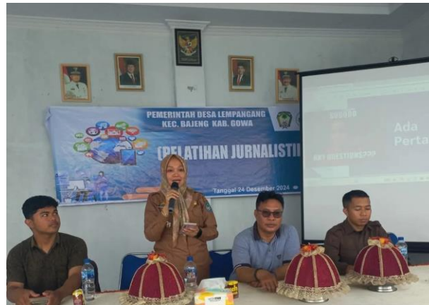
Picture 2. Welcome by Mrs PLT Lempangang Village

Therefore, the citizen journalism teaching material starts with a basic understanding of journalism by the citizen journalism lecturer: what journalism is, its impact, and how to utilise it to boost village potential in digital and social media. Participants are expected to recognise that citizen journalism and online media have a greater impact than interpersonal communication.